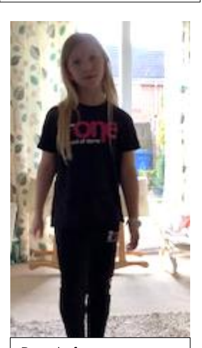
Ready for some dancing!