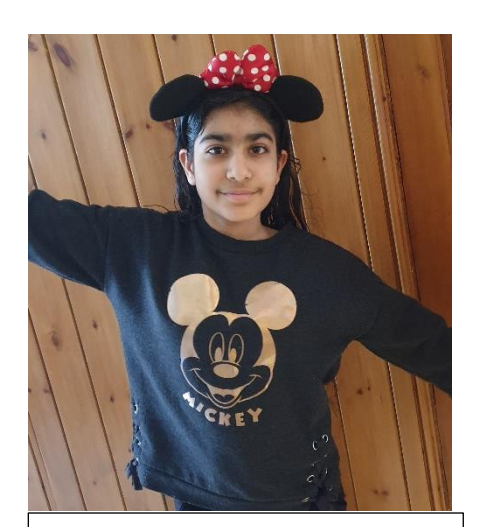
I've put on my Disney things, because it makes me happy.

He's wearing the football kit to express his love of football!! The beard to show he wants to be wise. The sock puppet as he loves to be creative and the hat to show his fun, colourful side.