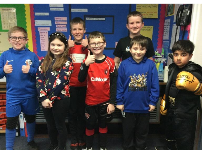
The Chatsworth & Glossop bubble looking great!