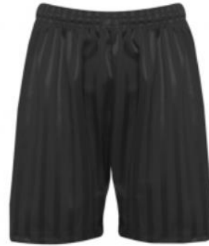
Plain black shorts or joggers