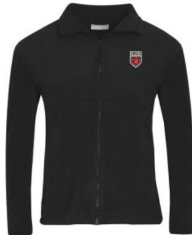
Optional black fleece with school logo