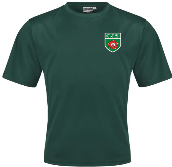
Technical t-shirt with/without school logo

Every child will be given a CJS PE bag for their kits. The bags will be kept in school and children will change for PE.