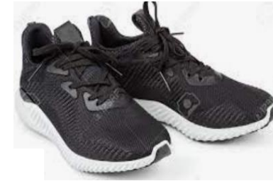
Trainers (ideally plain black)